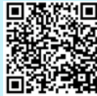
Not the Turkey Truck