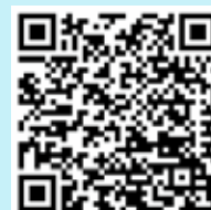
Dutch Flat Rd.