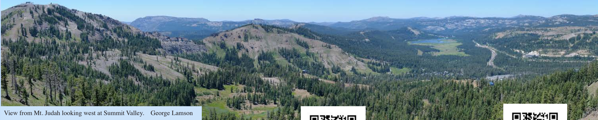
View from Mt. Judah looking west at Summit Valley. George Lamson