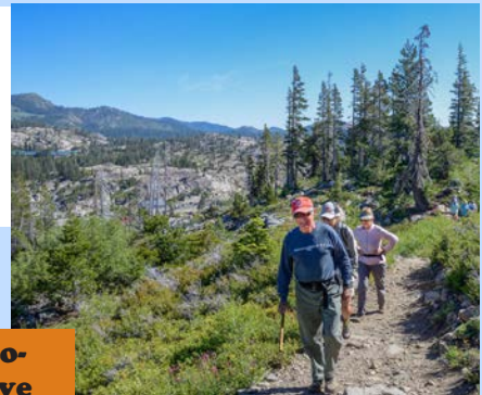
Hikers on the PCT/Judah Loop Trail