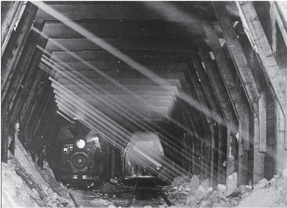
Left: snowshed picture probably by Alfred A. Hart, photographer for the CPRR from the Sugar Bowl collection.

"Through the vents in the roof the interstices between the roof-boards, the sunlight falls in countless narrow bars, pallid as moonshine. Standing in a curve, the effect is precisely that of the interior of some of Gothic cloister or abbey hall, the light streaking through narrow side-windows. The footsteps awakes echoes, and the tones of the voice are full and resounding."