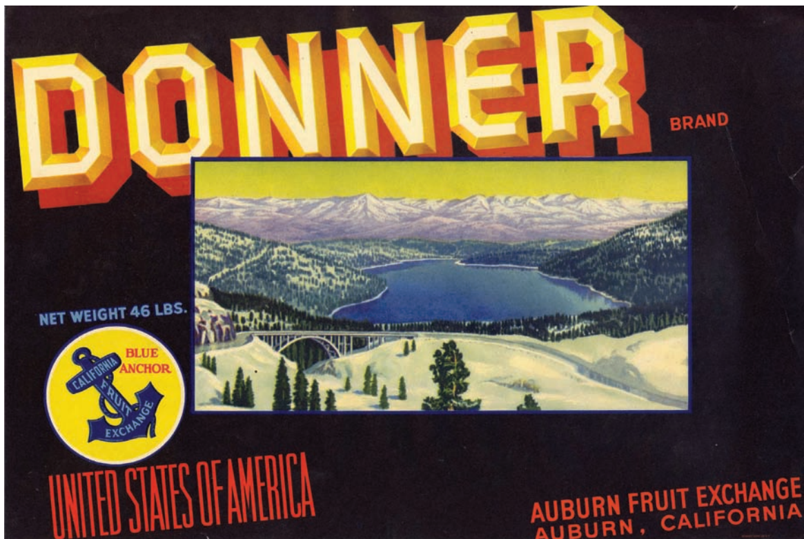
Vintage California fruit label featuring Donner Summit form the DSHS collection.

"Through the vents in the roof the interstices between the roof-boards, the sunlight falls in countless narrow bars, pallid as moonshine. Standing in a curve, the effect is precisely that of the interior of some of Gothic cloister or abbey hall, the light streaking through narrow side-windows. The footsteps awakes echoes, and the tones of the voice are full and resounding."