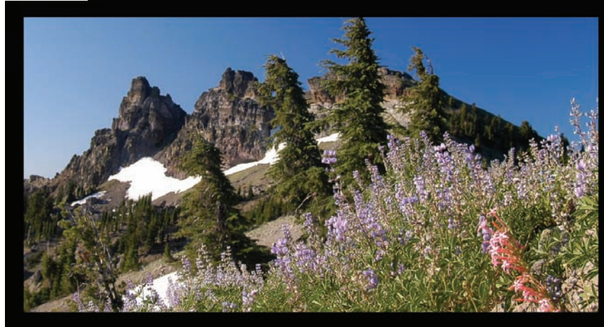
above: "little bits of wild garden and lawn, where butterfly and bird resort, and the air is sweet with perfume. ... red lilies swing their bells; lupins [sic] and larkspurs call down the tint of heaven; ferns shake the delicate plumes, bright with drops of dew ...the delighted pedestrian lingers as such oases, loth [sic] to go forward..." A hundred forty years later the descriptions still fit. Pictures above taken at Castle Peak on the Basin Peak side.