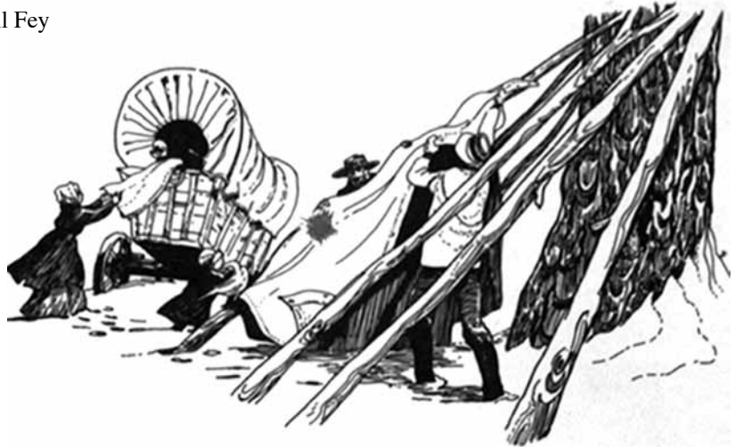
Donners at Alder Creek

The Alder Creek Trail was a final leg on the long arduous journey across the country for the advance Donner Party consisting of the Breens, Graves, Murphys, Fosters, Kesebergs and Reeds clans before wintering at Donner Lake. Detained by a broken axle, the trailing Donner families were only able to proceed 2 miles up Alder Creek Valley before they were stopped by heavy snow and forced to hastily erect tent-like shelters.