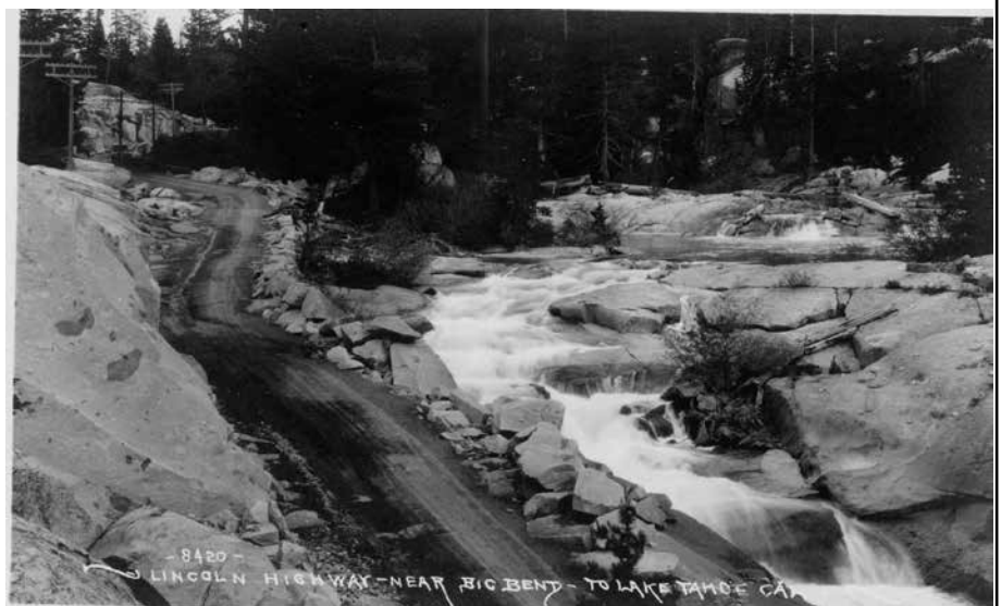
top, Donner Summit circa 1920; middle, Big Bend 1920; bottom, Lincoln Highway 40 just above what is now Rainbow Lodge