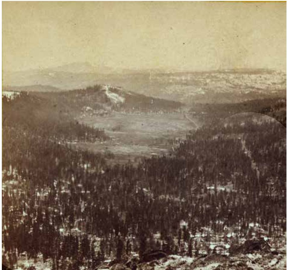
Alfred A. Hart #191 view of Summit Valley from Mt. Judah, about 1867. Today's Soda Springs ski hill has the light spot at the end of the valley. Red Mountain is in the far distance.

Up, up, we toiled wondering every five minutes how 'the dickens' ox teams & and wagons can get over here, & it is a wonder indeed, until.... we arrived at the foot of the terrible 'Passage on the backbone.'" For half an hour before arriving