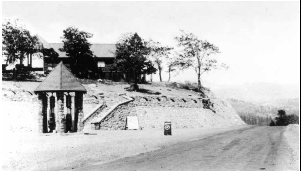
T.C. Wohlbruck's rest stop, the four pump gas station, cafe and lodging at Emigrant Gap. The Lincoln Highway is on the right. This sits about where the current viewpoint on I-80 is.

Norm went off to the now DSHS archives and indeed there was the four pump gas station at Emigrant Gap. Right nearby was something else though- a picture of the Pioneer Memorial at the Donner State Park. There was distinctive white lettering on both postcards which also looked familiar and that set off a further search. The more Norm looked the more postcards began appearing with the distinctive white lettering (look at the postcards on the next page). The pictures were very good and they covered all kinds of subjects: the highway 50 area, Lincoln Highway, Reno, Highway 40, and the Lincoln Highway. The more Norm looked the more he found with the distinctive lettering. Who had taken those pictures? There were some clues. Some pictures included "TCW." Who was TCW?