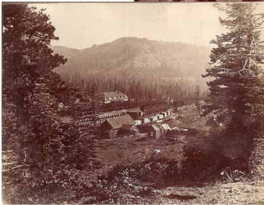
Summit, the railroad yards on Donner Summit. The large building in the background is the Summit Hotel (the second iteration built after an 1895 fire. In the back background is Red Top which goes by "Mt. Disney" today.