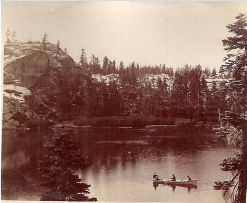
Three people in a canoe on Lake Angela Date unknown.

People on Donner Pk. Date unknown. Woman and boy on granite rock. Given that it's granite, where else could it be except Donner Summit?