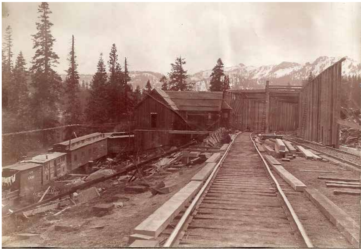
Building between Horseshoe Bend and Tunnel 41; looking towards Squaw Valley, just below Donner Summit