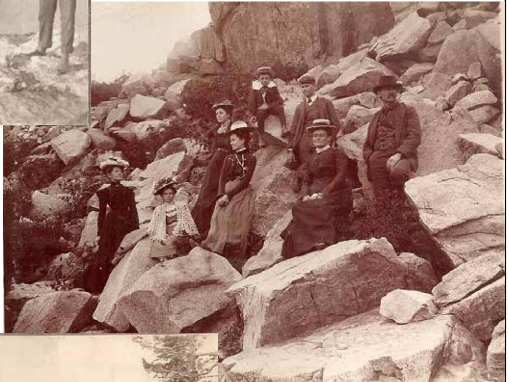
Family enjoying a rest on the rocks near China Wall and above Tunnel 6.