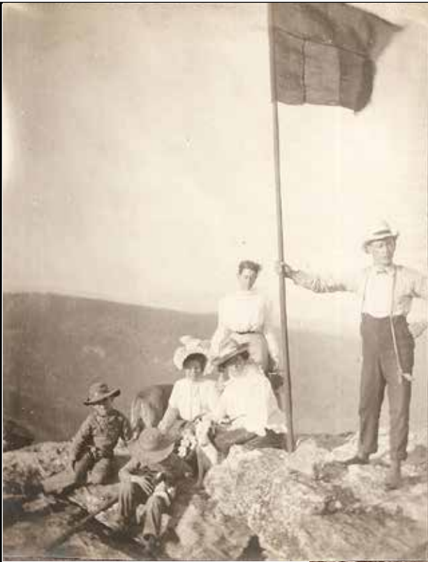
The family and the dogs were apparently serious about conquering Donner Pk.