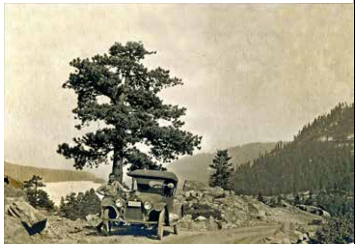
Above, automobile on the Lincoln Highway about 1920. Can you find the location?

8. Route of the Dutch Flat Donner Lake Rd., the Lincoln Highway, and the route of the emigrants until 1846. Just under the cliffs there is trail that leads from the Pacific Crest trailhead down through the 1914 underpass, under the railroad bed, across granite slabs and through forests all the way to Donner Lake. This is the route of the Dutch Flat Donner Lake Wagon Rd. built from 1862-1864 to serve as a toll road and to help with the railroad building. It later became one of the roads used to make up the Lincoln Highway. Before all that it was also the route for emigrant wagon trains in 1844, 1845 and part of 1846. In 1846 Roller Pass and then Coldstream Passes to the south were discovered. The emigrant route moved there so the emigrants would not have to take apart their wagons to get over Donner Summit anymore.