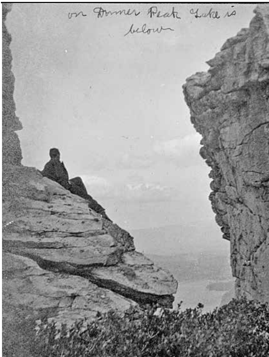
1901 photograph of the notch at the top of Donner Pk. Donner Lake is below.

Chinese railroad workers. Half way along is the shaft that goes to the surface so that four faces of the tunnel could be worked at once. Even working four faces the workers only made progress of inches a day.