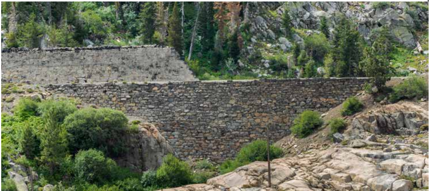
The lower wall is China Wall, built in 1867-68 from the insides of the tunnels. All the rock was placed manually and fits together with no mortar. Walk up close and you can see tool and drill marks of the Chinese builders.

might also want to use the website to find 20 Mile Museum signs. Many of the above subjects are also subjects of those signs and each contains a story, the history, and pictures. There is also a page of Donner Summit brochures.