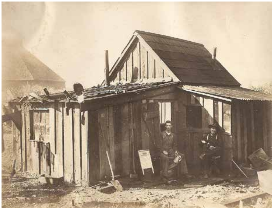
Railroad workers on Donner Summit. To the left is the building housing the turntable which turned around helper locomotives after they'd helped trains up to the summit. Date unknown